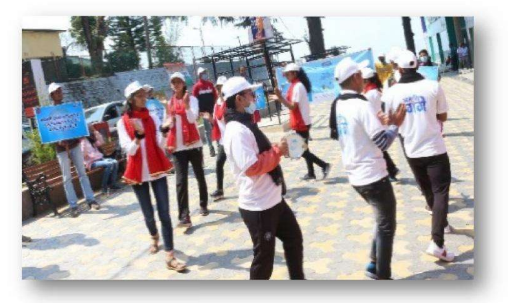
Fig: Glimpses of Namami Gange programme