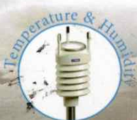
Temperature & Humidity